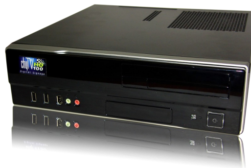
ChyTV HD 100